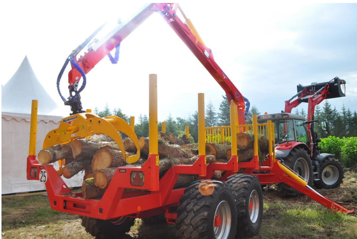
XYLOTRAIL 18 forestry trailer with 8 m XYLOGRUE 8 PRO crane

Forestry trailer and crane with increased capacities !